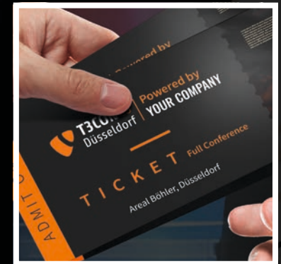
Five Conference Tickets included