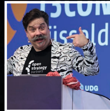
Exclusive Mention in Keynotes